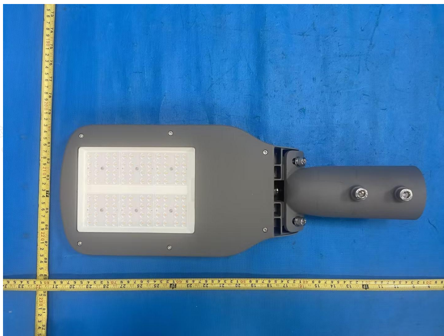
Photos of STL-30W-NS10